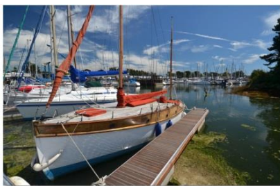
Emsworth Yacht Harbour, Hampshire, England